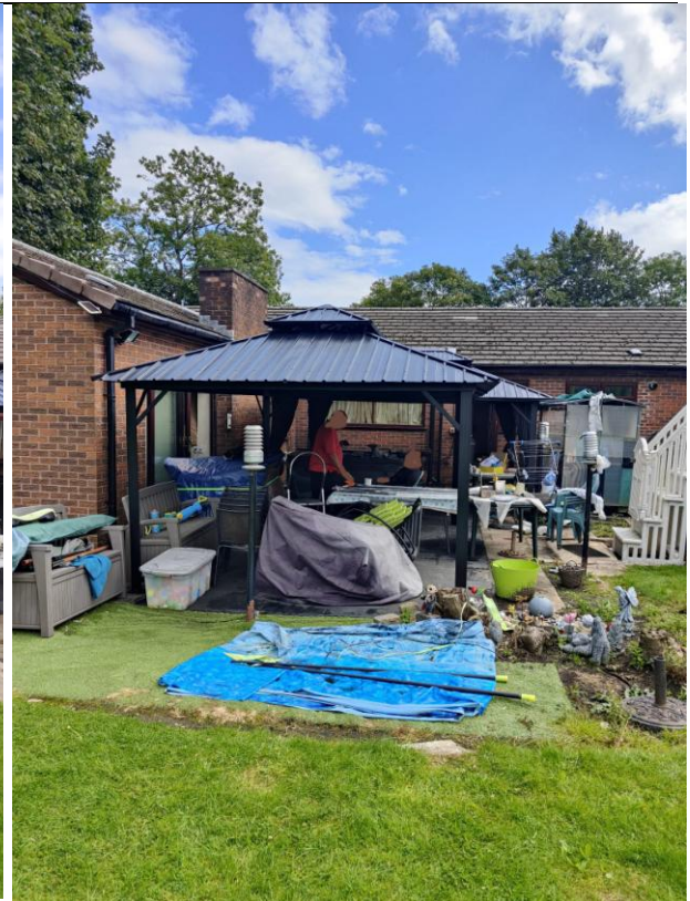
Fitted 30m LED strip lighting (RGB with Remote) (Our personal added extra)